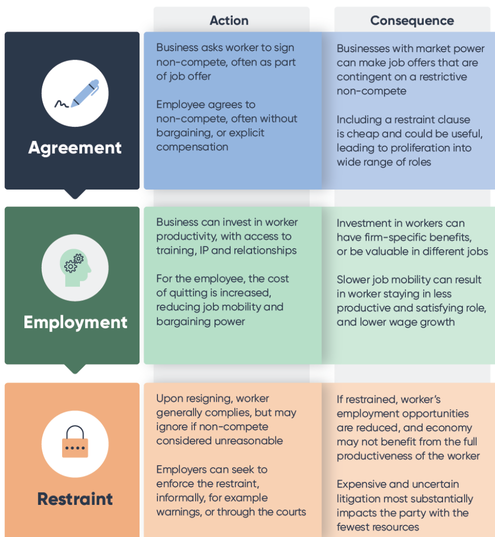
Figure 3: Lifecycle of a non-compete clause

Figure 3 outlines key elements and consequences across the lifecycle of a non-compete clause from the start of the worker's relationship with the business, during employment, to when a worker resigns, and the considerations faced and the options available to businesses to enforce a restraint.